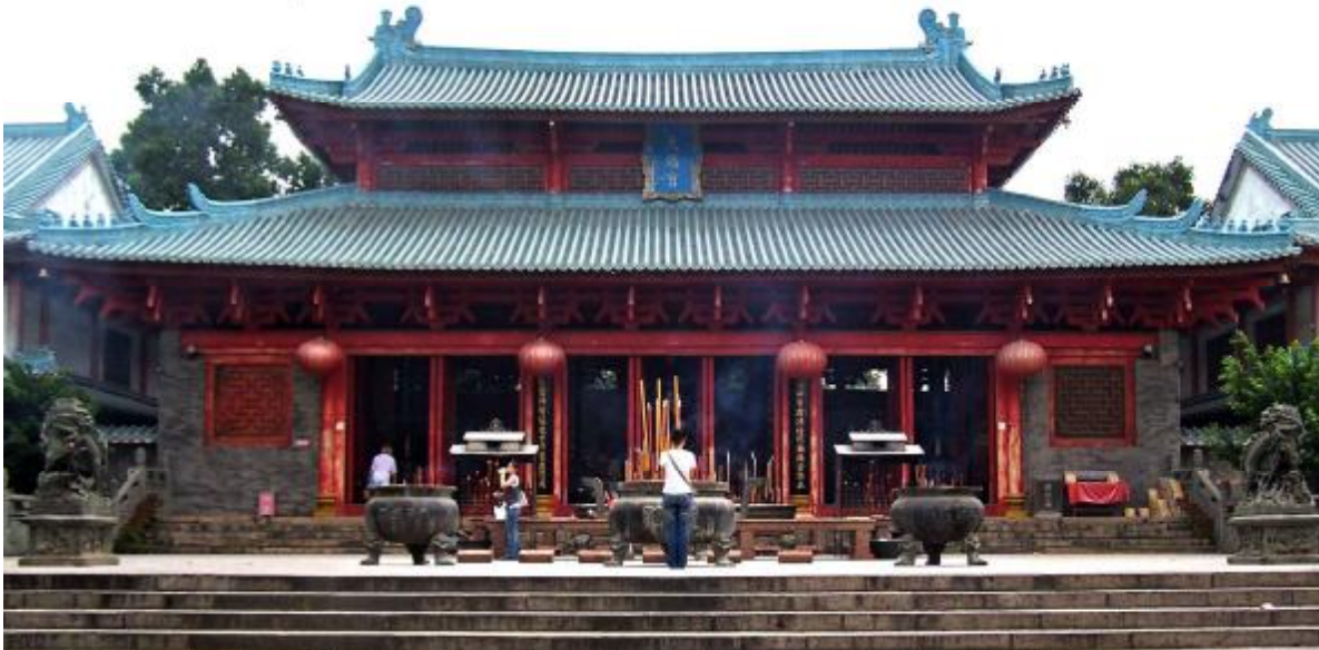
Chiwan Tin Hau Temple