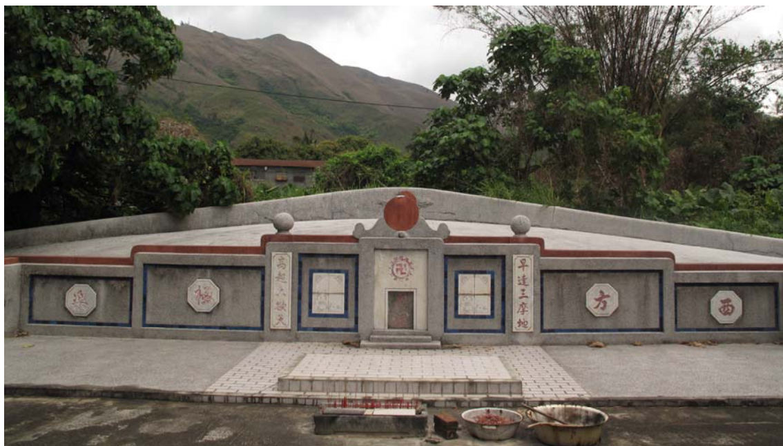
Picture of mass grave at Miu Kwok Yuen Nunnery